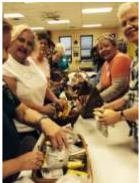
Share Pilot quests filling baskets with Pick Me Up treats