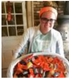
volunteer at Flint Hills Therapeutic Riding Center

A Share Pilot was used to fill baskets with Pick Me Up treats for caregivers at Presbyterian Manor Nursing Home and for volunteers at Flint Hills Therapeutic Riding Center. Prairie Pilot has had a close relationship with these two organizations for many years. The event also included 2 speakers working with wounded warriors, who are helping the club find a recipient for an AMBUCS trike for a vet.