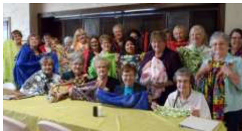
Fleece project completed