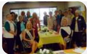
Miss Kansas with Pratt Pilots

Pratt Pilots had a visit by Miss Kansas at the April meeting and recently completed the fleece project.